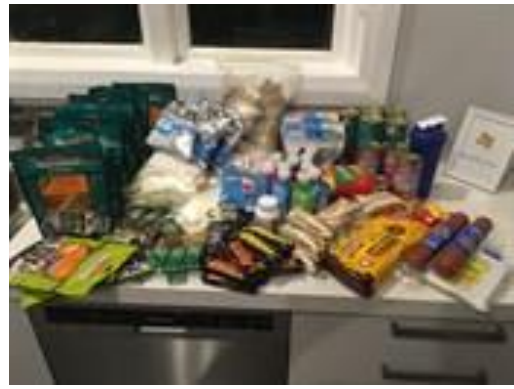
Snacks Snacks and more Snacks

During our race encountered some pretty hair raising moments shimmying down near vertical cliffs, a 120m abseil in the middle of the night in pouring rain that saw us ascend nearly upside down due to the weight of our packs and we navigated our way through about 2km of an underground cave network.